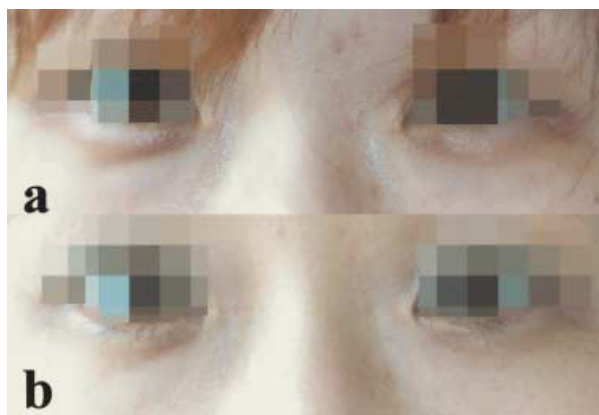
Figure 2 (a, b) After 8 weeks, swelling and infraorbital dark circles decreased in size and colour on the bilateral lower eyelid.

effective and 11 (19%) not effective (Table 2). Five patients developed contact dermatitis although the dose of the vitamin mixture used was low. These results might derive from differences in skin characteristics, such as skin barrier function or the size of melanosomes between whites and Asians. In fact, the skin of the lower eyelid is very thin so that application of various ointments or creams can readily penetrate the epidermis. However, in this study, increased pigmentation due to ageing or other factors was not clearly demonstrated. Although low doses of vitamin C were not effective in reducing infraorbital dark circles caused by dominant pigmentation, some reports have indicated that the application of a lotion containing high doses of vitamins is effective in reducing facial pigmentation. 6 In this study, many infraorbital dark circles disappeared following application of the gel, which suggests that most dark under-eye circles in young adults result from haemostasis and that the effects depend on the depth of haemostasis in the dermis.